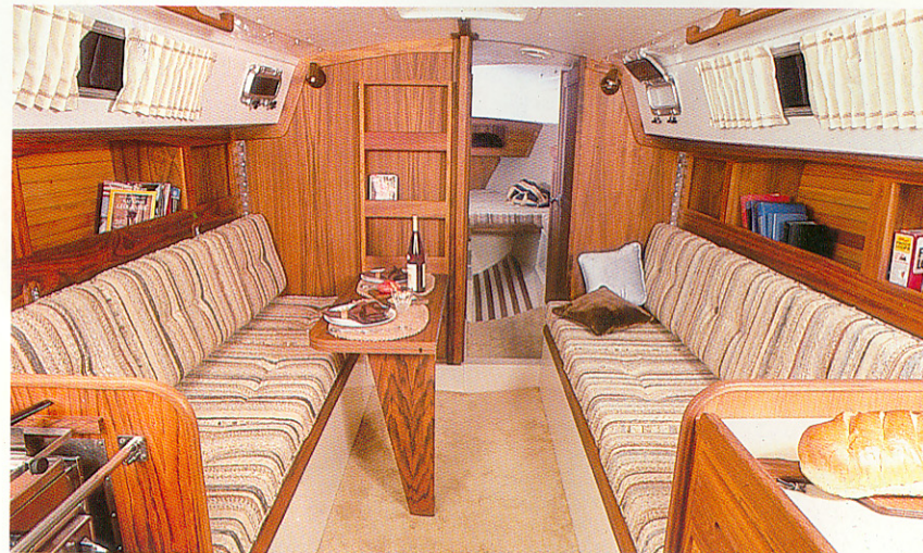
Overhead handrails, cypress hull ceiling, teak bulkheads and custom laminated fiddles—Cal!