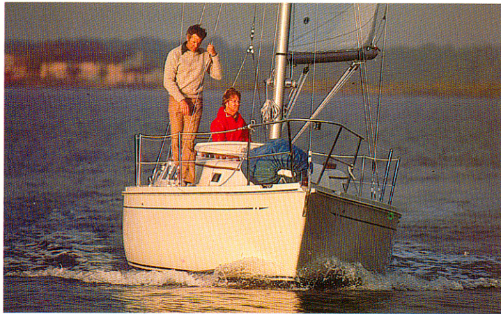
Cal 31's are loaded with standard equipment.

A trip to any recent boat show or a browse through a current sailboat directory will quickly reveal increasing numbers of boats in the 30-foot range designed for the committed racing sailor. Boats that look fast—and in many cases are fast—but that are not necessarily comfortable or easy to sail. Because as speed has become more important, keels have narrowed and deepened, hull shapes have broadened and flattened out, rigging has become more complex, and accommodations more spartan. The result? Boats