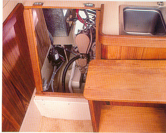
Access to the fresh water cooled diesel is quick, easy and in the open.