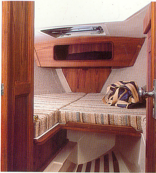
Large cabin forward with translucent hatch, hanging locker, storage alcove forward.