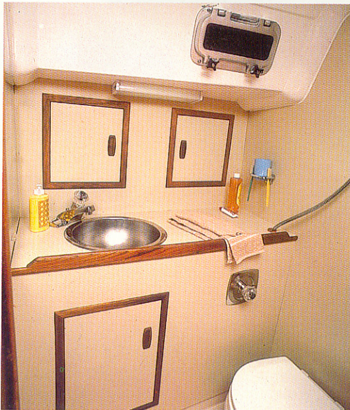
Hand-held shower, plenty of fresh air and lots of storage make this head something different.