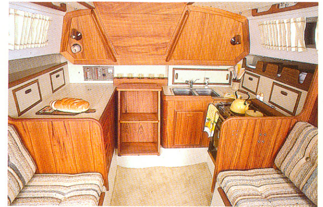
Interior redesign features teak-trimmed laminates.

The cockpit is big enough for comfortable lounging, yet compact and self-bailing for serious off-shore and heavy weather work. Going forward in a breeze is made safer and easier by the non-skid pattern molded permanently into the deck surface, teak grab rails that extend the full length of the cabin roof, and stainless steel stanchions with lifelines. Stainless steel double bow and stern pulpits, and the transom mounted swimming ladder are all standard. The flush mounted, self-draining locker in the foredeck and the stainless steel stemhead fitting with roller make anchor work fast and easy. A huge 2-foot square foredeck hatch provides excellent access to sails stored below, as well as plenty of light and ventilation in the forward cabin.