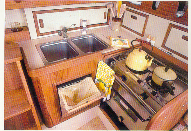
Sea cooks and liveboards find lots to like in the new Cal 31 galley.